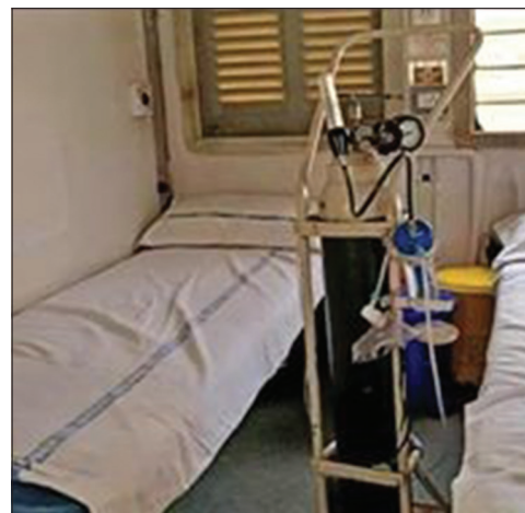
Figure 6: Oxygen cylinder for COVID Care Coaches

RAISA members are contributing significantly in the training of medical and paramedical staff for the “throat and nasal swab taking” along with Railway ENT specialists, training and demonstrations of