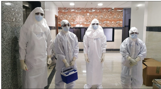
Figure 3: Team ready for Isolation Duty at Jagjivan Ram Railway Hospital, Mumbai