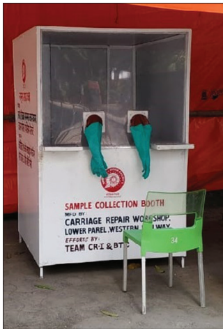
Figure 1: Sample collection booth crated by WR Workshop Mumbai