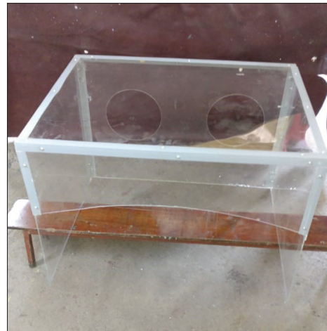
Figure 4: Intubation Shield prepared at WR Workshop, Mumbai