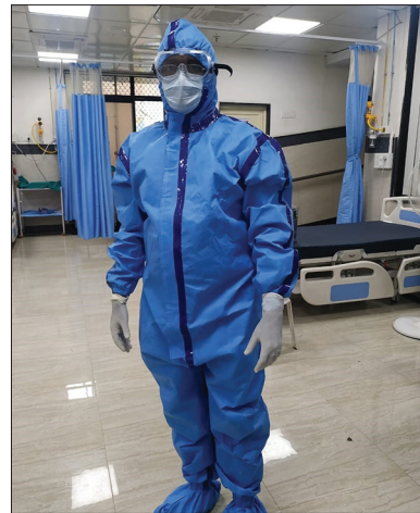
Figure 2: Coverall manufactured stitched at WR Workshop, Mumbai